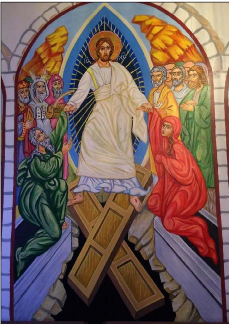
Resurrection of Our Lord, God, and Savior, Jesus Christ Icon of the Descent into Hades

NEXT FAMILY GAME NIGHT: Our last Family Game Night was a big success! We look forward to another fun evening playing board games, charades and eating pizza on Saturday, April 14 in the parish hall after the Vigil Vesper Divine Liturgy (approx. 6:30pm). Game night is open to parishioner families, young adult parishioners, senior parishioners, and friends of parishioners who want to join us. Please bring your favorite board games. It is also an opportunity to play games such as charades. To help cover the cost of the pizza, there will be a donation of $5 per adult and $15 per family for those who wish to share in the food. See you there!